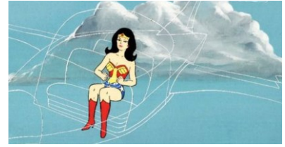
Introducing some of the unseen & overlooked women who helped create the field of aviation