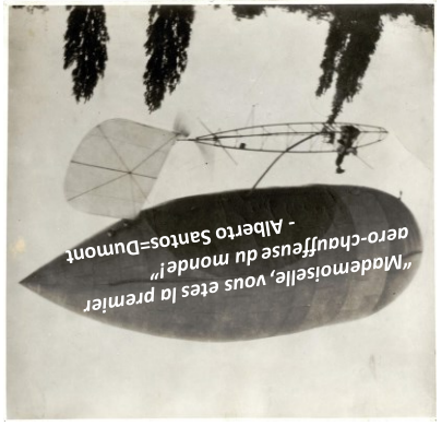
Her parents were horrified and made sure she told nobody, because "no man would want to marry a woman who had done such a thing."