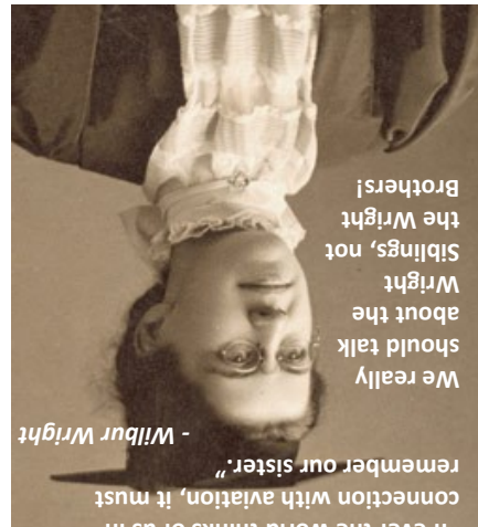
Katherine Wright graduated from Oberlin in 1898 (neither of her brothers graduated from high school). She played a HUGE role in developing the first airplane with her brothers.