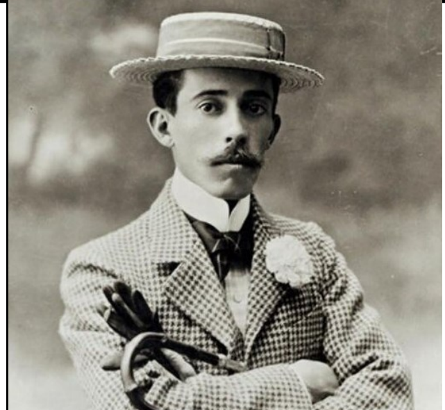
Alberto Santos=Dumont 1873-1932