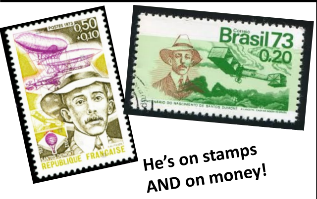
Santos=Dumont's #9 1903

Aida de Acosta is the only other person Alberto allowed to fly his dirigible. When she landed he said: "Mademoiselle, vous êtes la première aero-chauffeuse du monde." (Miss, you are the first woman aero-driver in the world!)